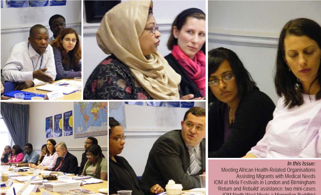
(14 May 2009, IOM London)

Insightful contributions and questions from the delegates enabled the IOM team (staff from the Operations, Reintegration and Communications departments) to give detailed information about the resources available and procedures in place to facilitate dignified and safe travel for people with medical needs. Furthermore, the delegates suggested ways of collaborating with IOM with particular focus on the interests of their target communities. It was agreed by all present that there was a need to explore opportunities for IOM to present its programmes at future events to be organised by the African Community organisations.